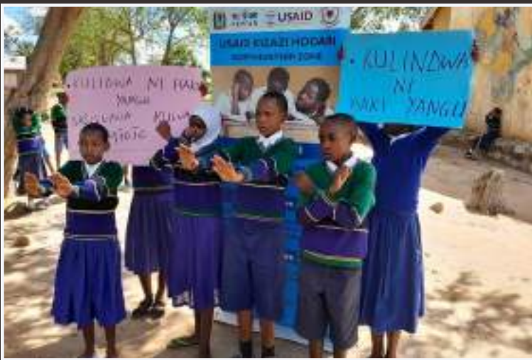
School children holding signs calling for children protection during the 16 Days of Activism Against Gender-Based Violence in Singida