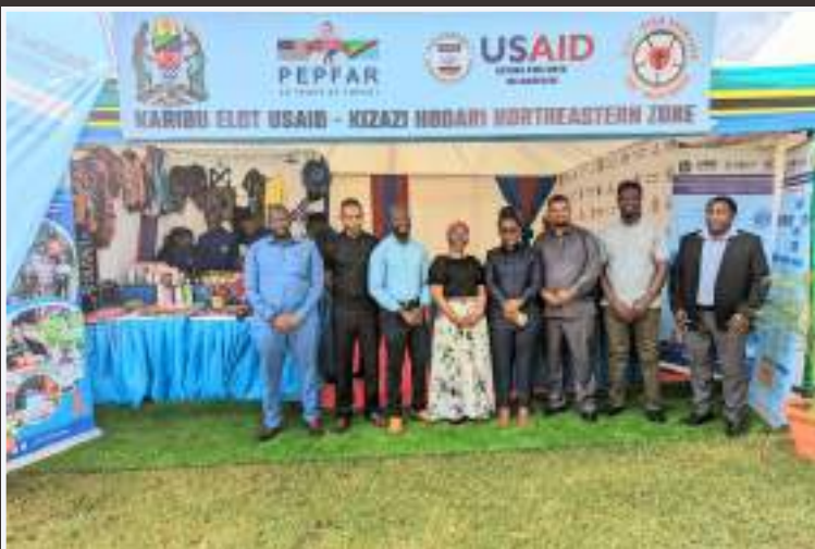
A group photo of the USAID Kizazi Hodari Northeastern Zone project staff who participated at the World AIDS Day national commemoration event in Morogoro Region.