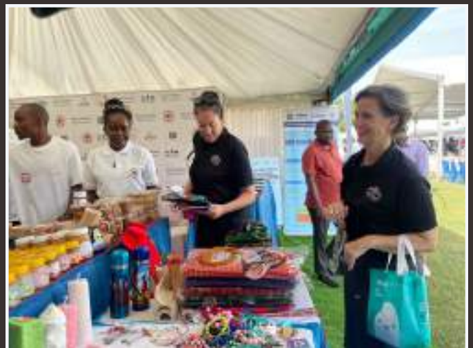
PEPFAR representatives (in black t-shirts) visiting the USAID Kizazi Hodari Northeastern Zone exhibition booth during the marking of World AIDS Day national commemorations held in Morogoro Region.